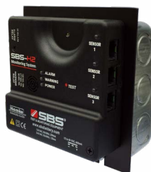
2-Gang Junction Box Hardwired AC and/or DC (optional)