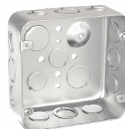
2-Gang Junction Box (Hardwired AC and/or DC)