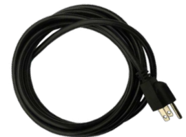
18 AWG AC Cord (optional)