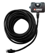
Additional Hydrogen Sensor with 25 ft., 50 ft. or 100 ft. Cable